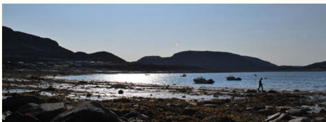
The rocky shoreline of Cape Dorset, Nunavut, at the north-western edge of the Hudson Strait.

Though the Hudson Strait is well travelled by Canadian Arctic standards, it still has a very low level of shipping activity; and this is confined mainly to the summer season. This Inuit homeland is an environment in which the influences of shipping have been quite limited in comparison with most other parts of the world, and one which represents a “baseline” condition for future observations of impacts. Gaps in current research on shipping and its effects on local