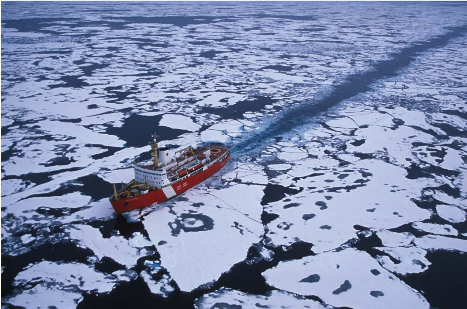
Aerial view of the Louis S. St.-Laurent, an ice-breaker research ship